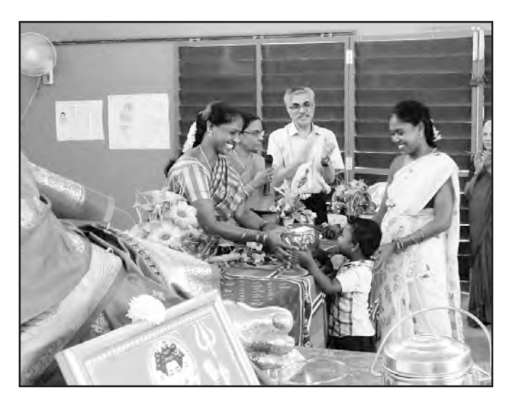
One of the best babies that won prize as 'best breast-fed' baby