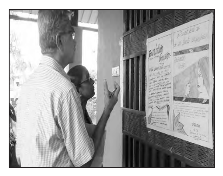
Competition for best Poster